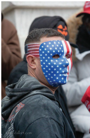
Image 4: On January 6, 2021, SuenRAM wore a painted American flag facemask and had an American flag painted on the right side of his head.