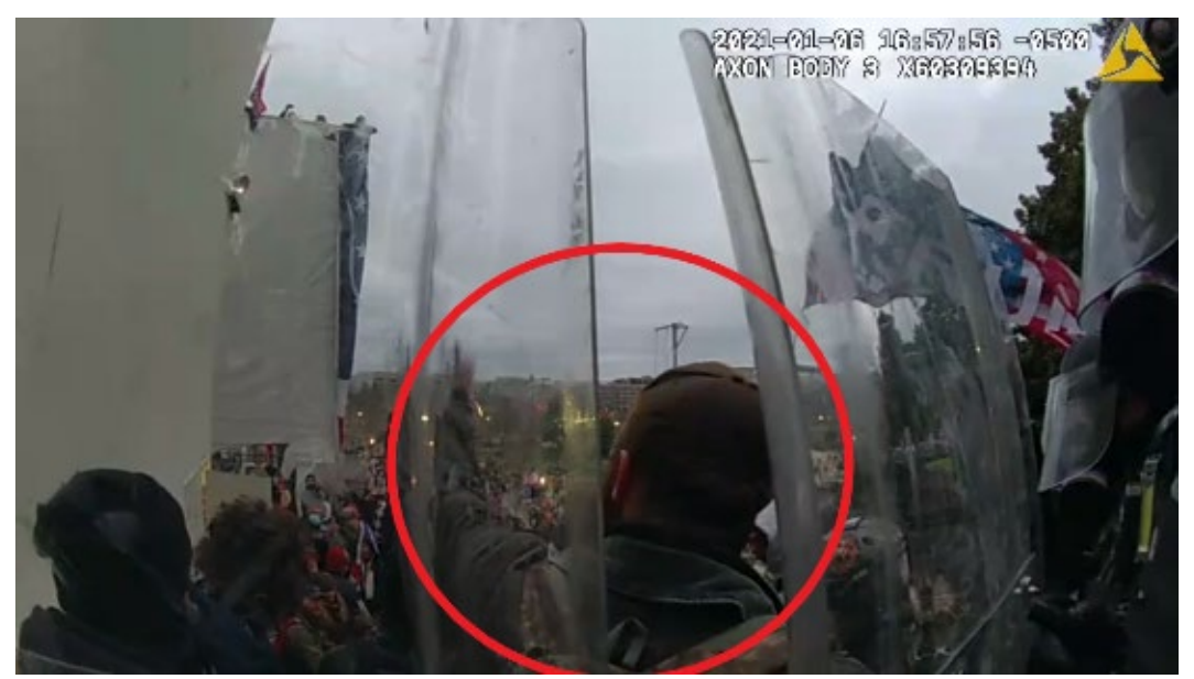
Image 13: Shuler (circled in red) as captured by Officer M.D.'s BWC

10. At approximately 4:57 p.m., as the police line approached the bottom steps, Officer M.D.'s BWC appears to show SHULER gesturing to others to meet him in front of the police line. See Image 13.