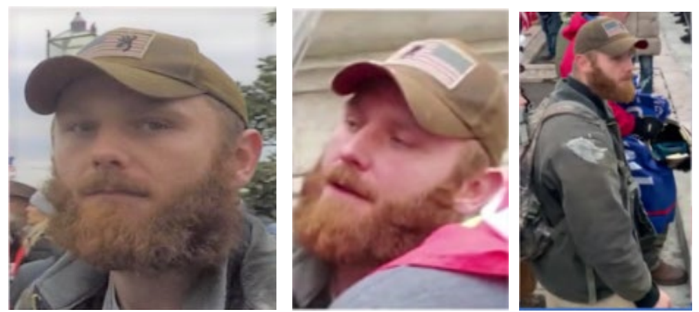
Images 1, 2, and 3 (left to right): Photographs Shown to Witness 1 and Witness 2

2. On October 21, 2021, the FBI Chicago Field Office interviewed an individual ("Witness 1") who has a personal relationship with SHULER. Witness 1 visually identified SHULER using photos taken from the Capitol grounds. See Images 1–3 below. Witness 1 also provided information about SHULER's Facebook account.