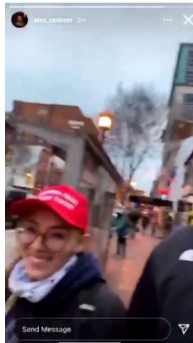
Screenshot of [REDACTED] Instagram video

PRADO's physical appearance and clothing in the Capitol Building CCTV footage matched her physical appearance and clothing from the video [REDACTED] had posted later that afternoon on [REDACTED] Instagram account: