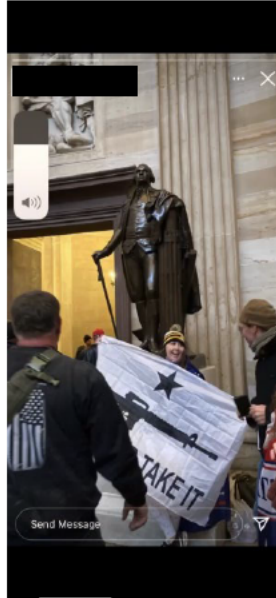
[REDACTED] Instagram Post