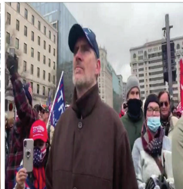
2021 Freedom Plaza