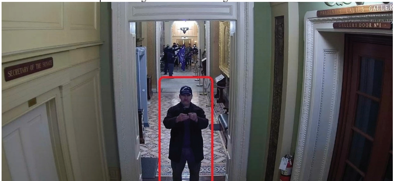
MODRELL within the Capitol

On March 30, 2022, the FBI reviewed Capitol CCTV footage depicting MODRELL within the Capitol building for approximately 25 minutes. At approximately 2:26 p.m. MODRELL entered the U.S. Capitol building through the broken Senate Wing window and proceeded to the Crypt. MODRELL made his way to the second floor, through the small House Rotunda, and by 2:36 p.m., entered the Grand Rotunda before taking the Grand Rotunda stairs to the third floor. On the third floor, MODRELL walked around the East Corridor and Senate Gallery appearing to film and photograph on his cell phone. At approximately 2:51 p.m., MODRELL exited the U.S. Capitol through the Senate Carriage Door.