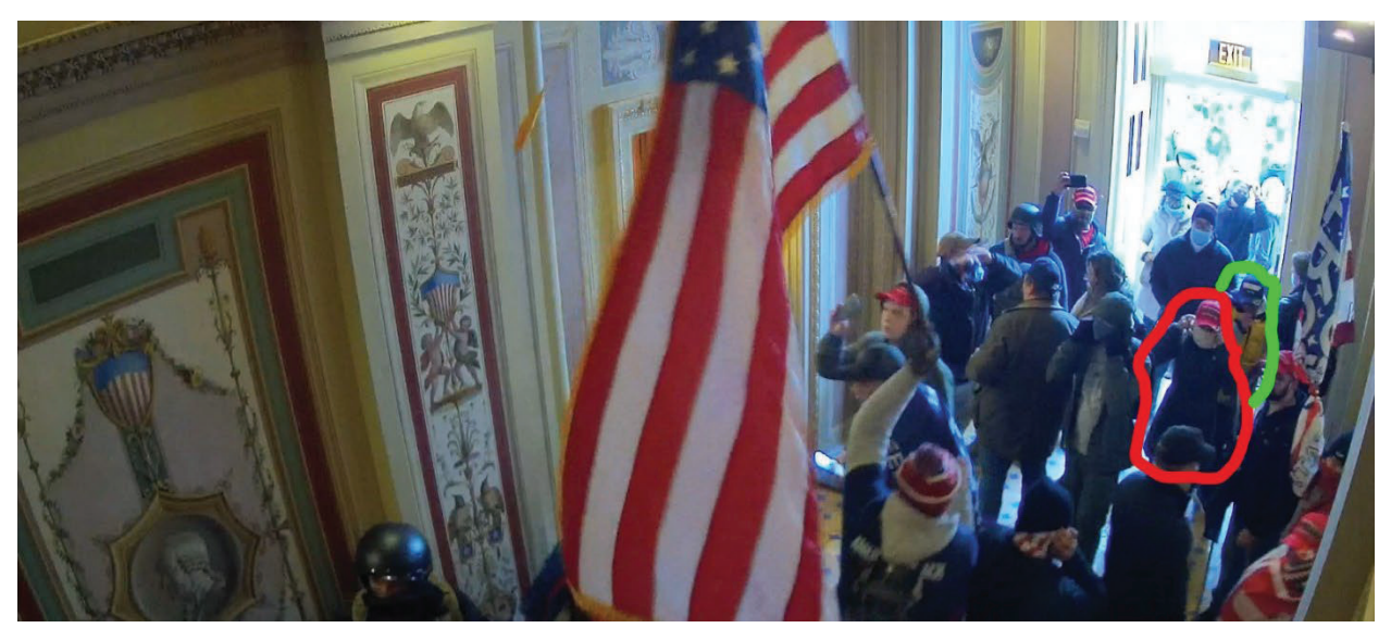
Image 1: Screenshot of CCTV footage showing DUONG and MILLER entering the U.S. Capitol through the Senate Fire Door.