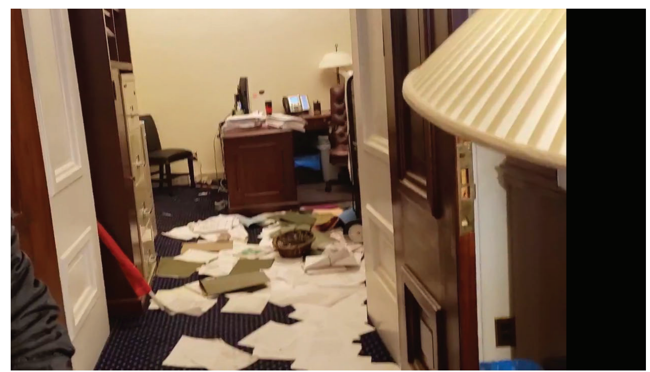
Image 3: Screenshot of MILLER'S video recording of the destruction that had taken place in the Senate Parliamentarian's office suite.