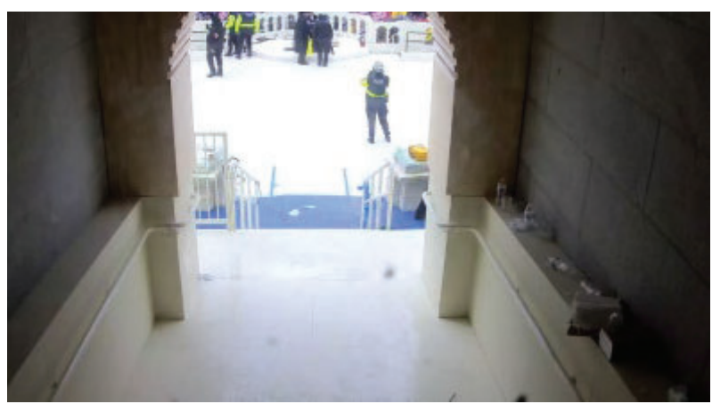
Image 2 (The "Tunnel" as seen on CCTV footage prior to rioters entering)