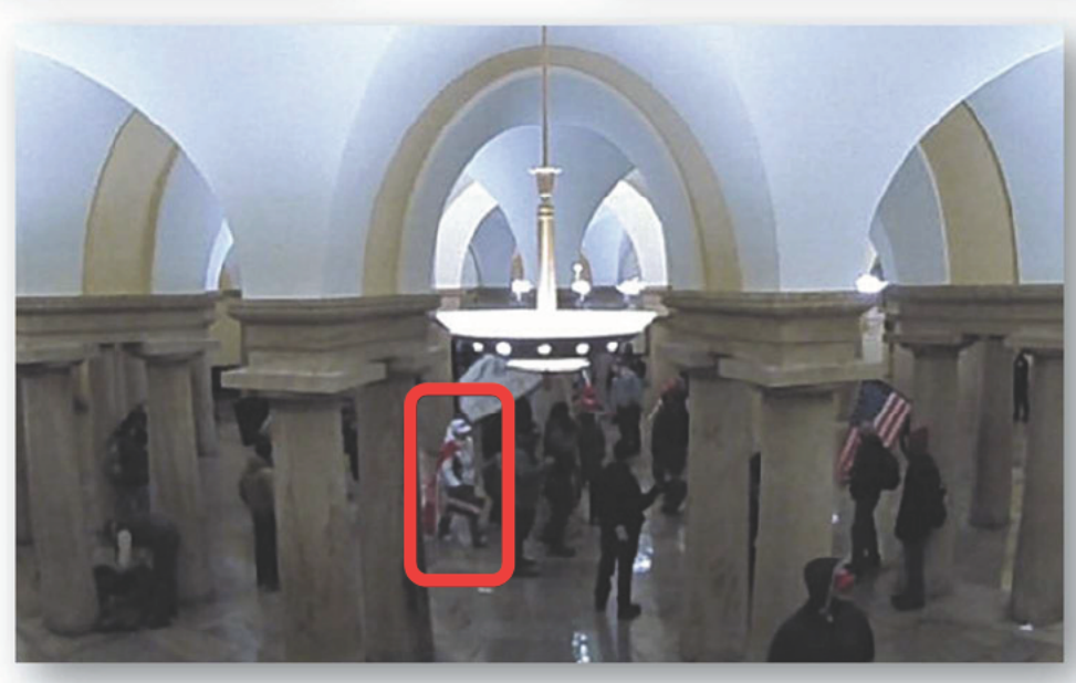
IMAGES 5, 6, 7: (top left) Screenshots from Capitol CCTV showing the defendant with a modified Bear Flag draped around her shoulders, walking south towards the Capitol Crypt; (top right) an individual that appears to be the defendant walking through the Capitol Crypt; and (bottom) an individual that appears to be the defendant walking through the Capitol Crypt.