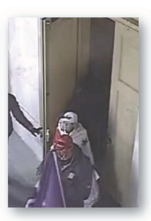
IMAGES 1, 10: (left) IMAGE 1 (see above); and (right) a screenshot from the Capitol's CCTV showing the defendant at approximately the same location at approximately the same time—3:33 PM—as IMAGE 1.