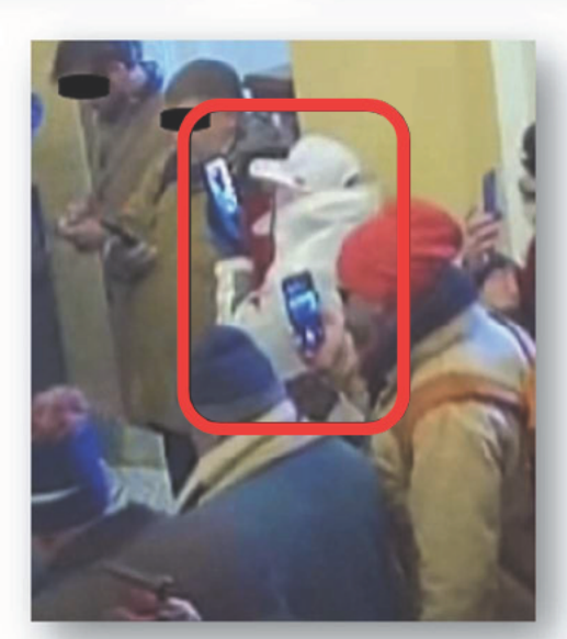
IMAGES 2, 3, 4: Screenshots from Capitol CCTV showing the defendant just after she entered the Capitol via the Senate Wing Door at approximately 2:55 PM. At one point, the defendant takes what appears to be a cellphone out from her jacket and moves it around in a manner consistent with recording videos and taking pictures.