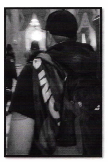
Figure 12 - Parler - u15B2m0pJPOV.mp4 Timecode: 0:51