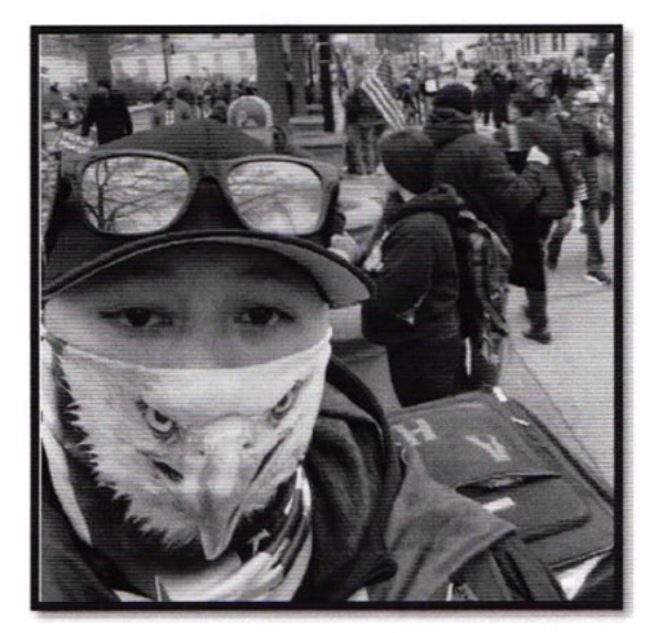
Figure 13 - Parler

On August 22, 2022, AT&T provided information in accordance with a Grand Jury subpoena issued for the subscriber information for phone number: XXX-XXX-8677. Relevant information is as follows: