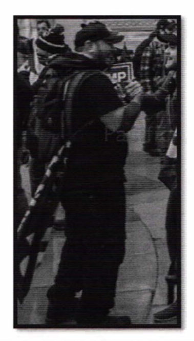
Figure 11