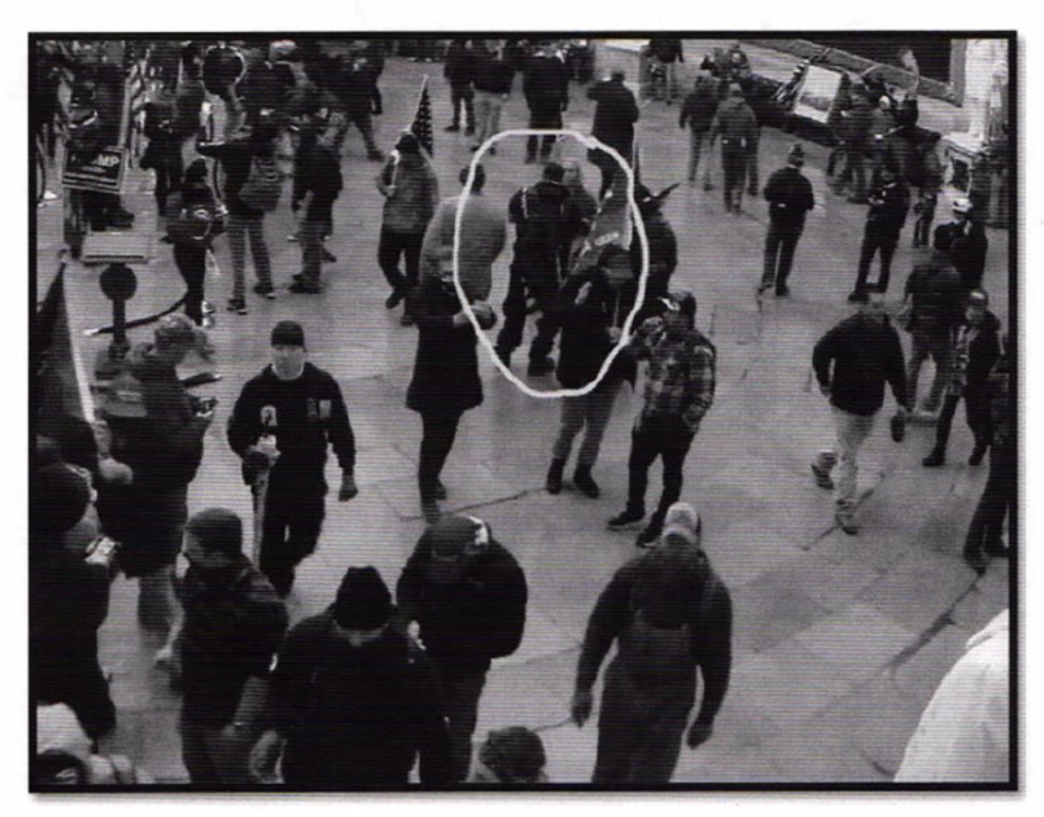
Figure 5 – U.S. Capitol CCTV at approximately 2:51 p.m.