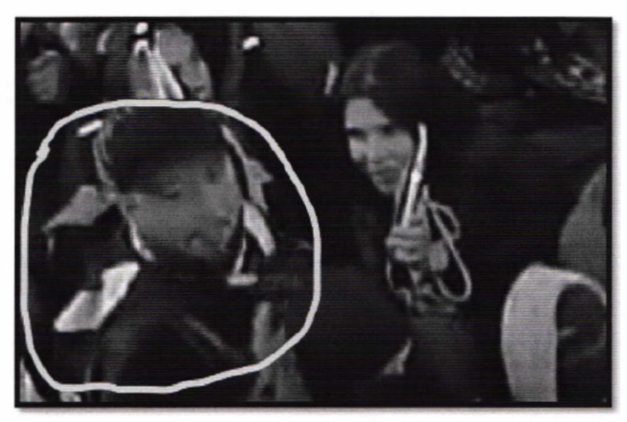
Figure 7 - U.S. Capitol CCTV (close-up)

In addition to the CCTV footage, an FBI Confidential Human Source (CHS) provided the following images of MARTINEZ during a review of open source platforms from social media and video streaming sites.