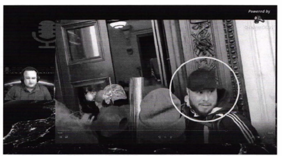
Figure 8 - Photo from Restoring Families Internet radio Network (RFIRN) Facebook account

In addition to the CCTV footage, an FBI Confidential Human Source (CHS) provided the following images of MARTINEZ during a review of open source platforms from social media and video streaming sites.