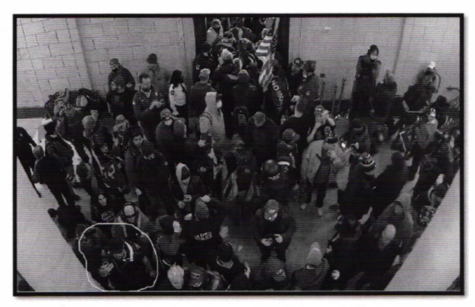
Figure 6 - U.S. Capitol CCTV at approximately 3:18 p.m.