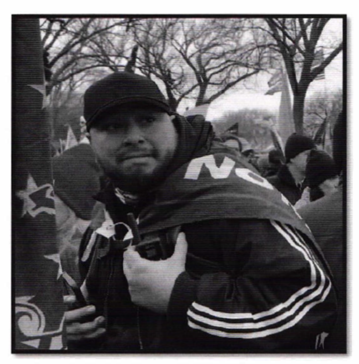
Figure 9 – YouTube | Peanut 411 (UCPtA3f603_x9xpler74cjJg) No Antifa/No Violence/White House Rally Pt2 Washington DC (no longer online) Timecode: 5:29