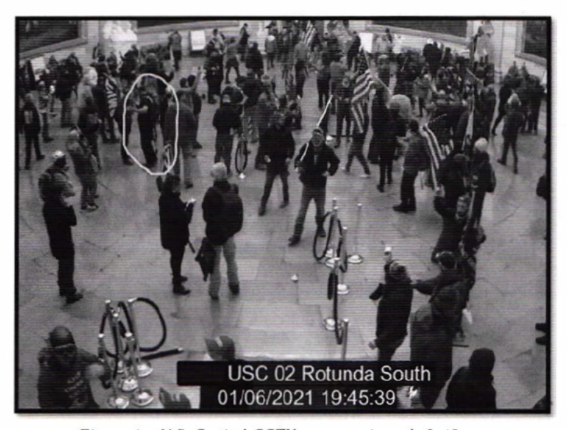
Figure 4 – U.S. Capitol CCTV at approximately 2:45 p.m.