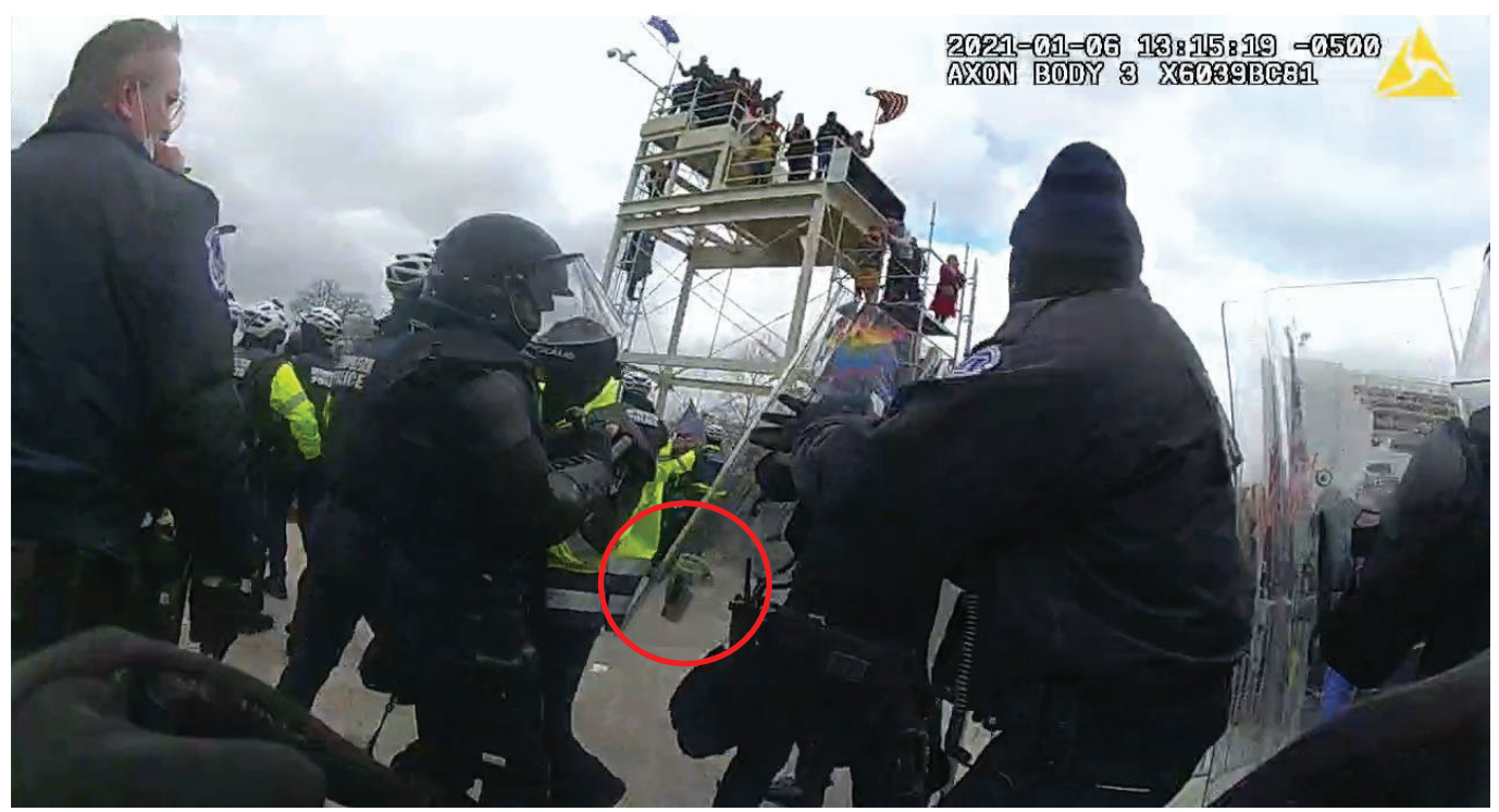
Exhibit 8 – Still of video footage from an MPD Officer's BWC