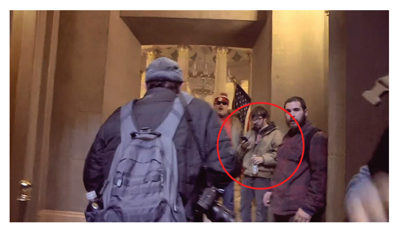
Exhibit 18 - Still of video footage from open-source<sup>7</sup>