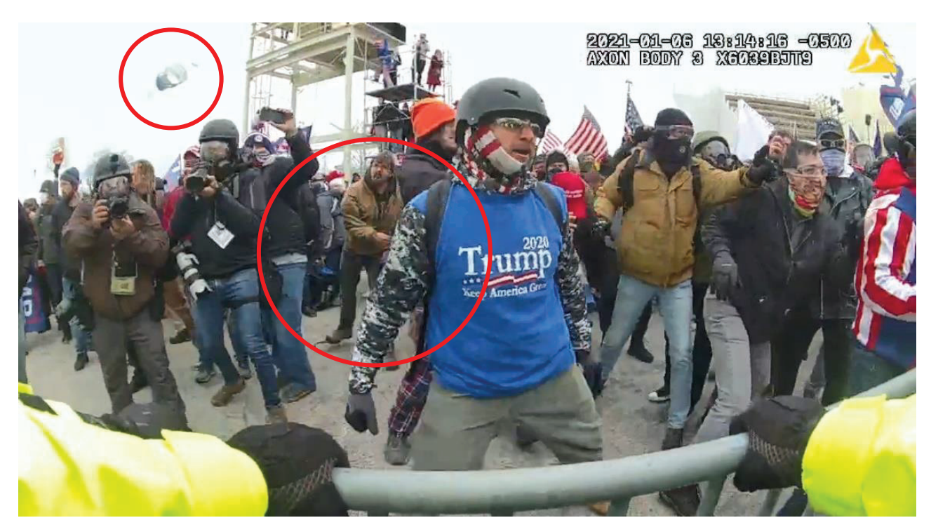
Exhibit 10 – Still of video footage from an MPD Officer's BWC