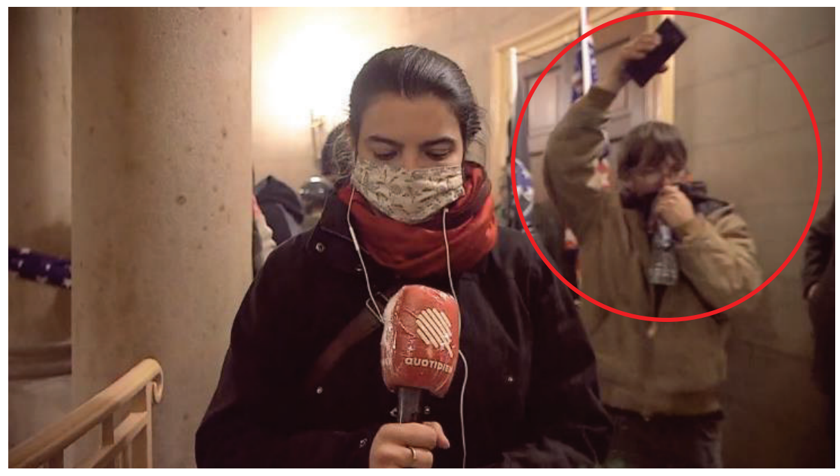
Exhibit 19 – Still of video footage from open-source ^{8}\,