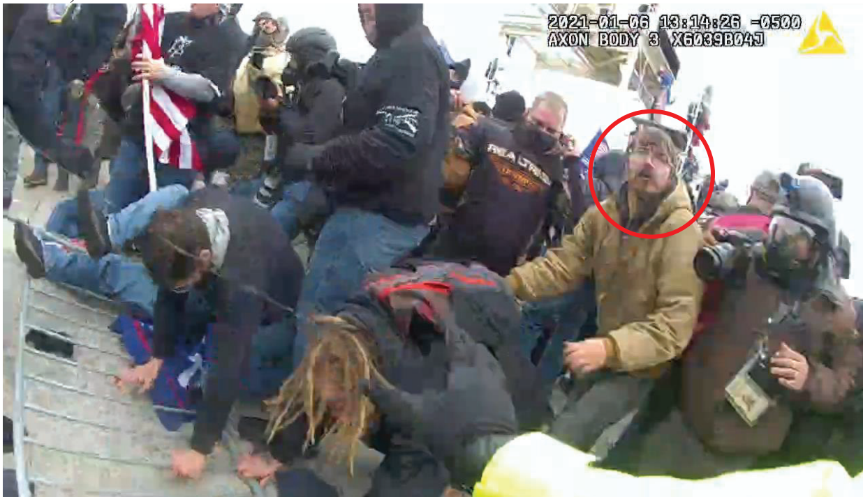
Exhibit 12 - Still of video footage from MPD Officer C's BWC

This individual was then observed making physical contact with an MPD officer (MPD Officer C) in a manner consistent with kicking the officer and then pushing the officer (Exhibit 12-15).