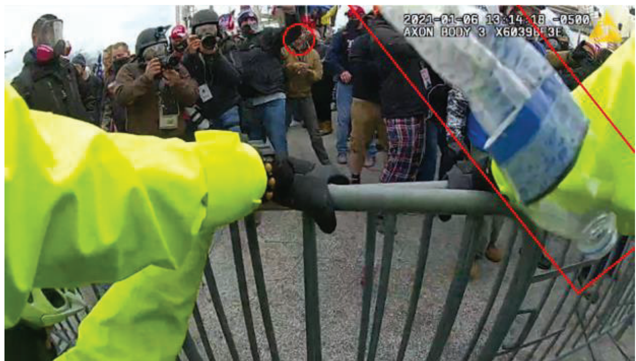
Exhibit 11 – Still of video footage from an MPD Officer's BWC

This individual was then observed making physical contact with an MPD officer (MPD Officer C) in a manner consistent with kicking the officer and then pushing the officer (Exhibit 12-15).