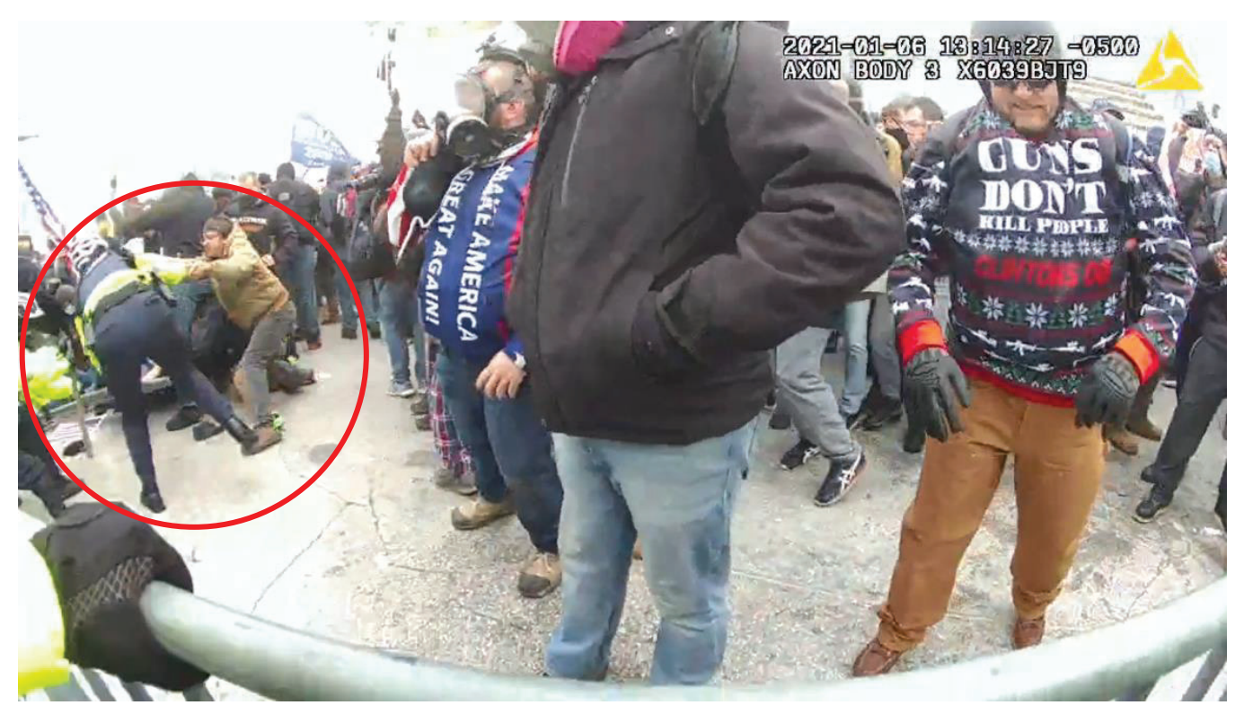
Exhibit 14 - Still of video footage from an MPD Officer's BWC

<sup>6</sup> https://twitter.com/DrewHLive/status/1346948772308406275?s=20&t=TzRun00V-LeqhuVLyZYy