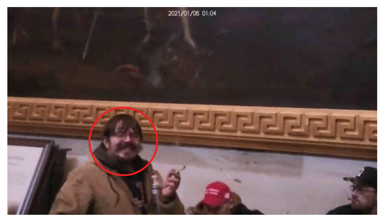
Exhibit 21 – Still of video footage from open-source<sup>9</sup>