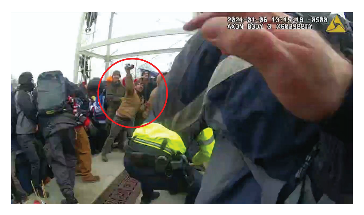
Exhibit 6 – Still of video footage from an MPD Officer's BWC