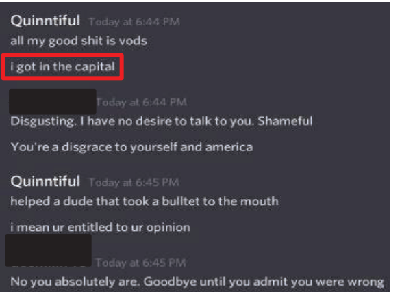
Exhibit 2 (section enlarged and highlighted to reflect text)

According to records subpoenas from Discord, the subscriber information associated with user account Quinntiful#711 was attributed to the Google Account and the8746 number.