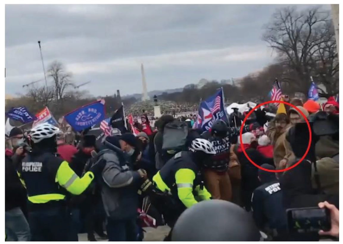
Exhibit 5 – Still of video footage from open-source ^4