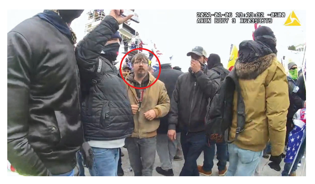
Exhibit 22 - Still of video footage from an MPD Officer's BWC