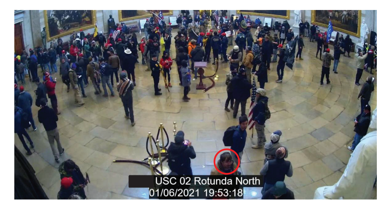
Exhibit 17 – Still of video footage from U.S. Capitol CCTV