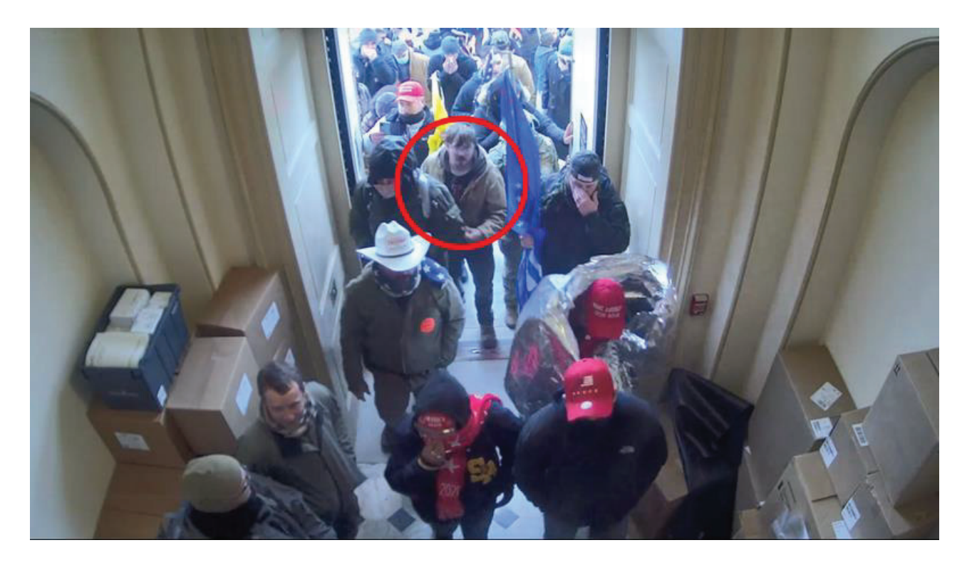
Exhibit 16 - Still of video footage from U.S. Capitol CCTV