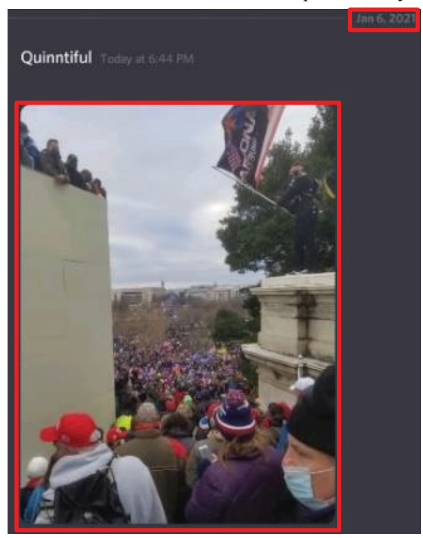
Exhibit 2 (section enlarged and highlighted to reflect date)