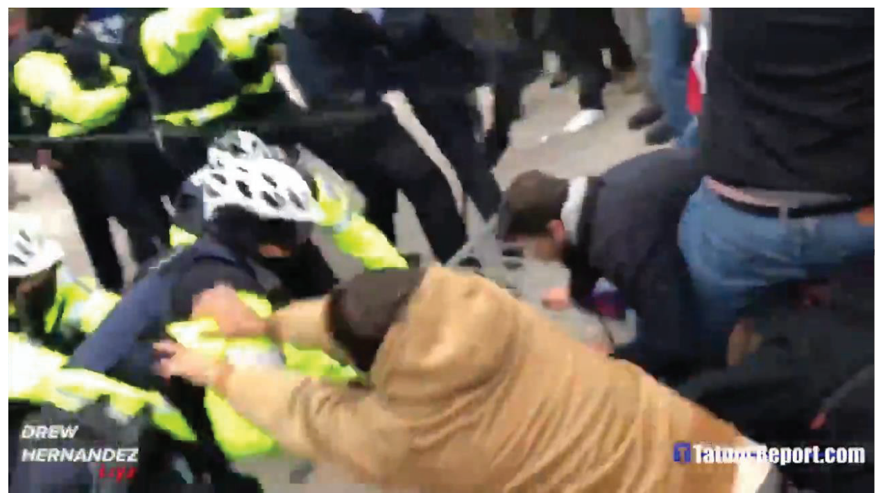
Exhibit 13 – Still of video footage from open-source<sup>6</sup>