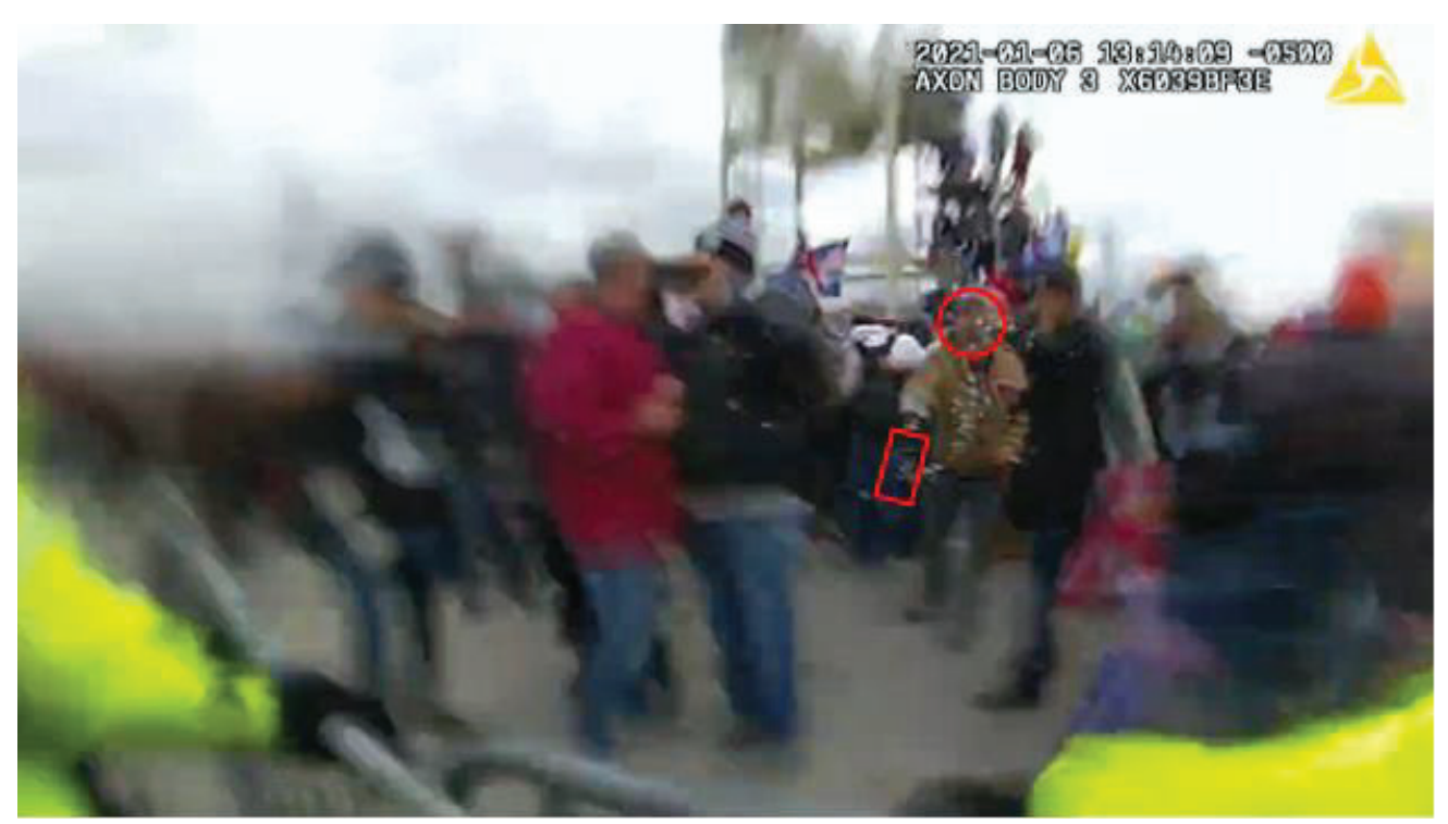
Exhibit 9 – Still of video footage from an MPD Officer's BWC

This individual was also observed throwing an unknown liquid from what appears to be a plastic bottle, and then throwing the actual bottle at law enforcement officers (Exhibit 9 - 11).