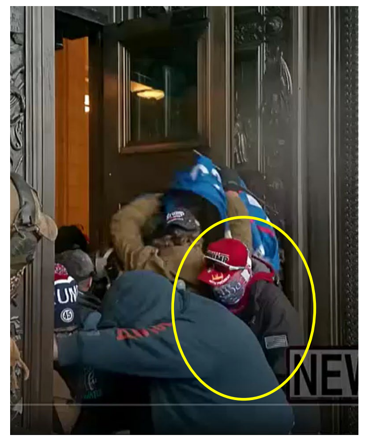
Image 18 (approx. 3:42 of https://www.youtube.com/watch?v=TJuhysJzbSA&)

The same video shows that officers then appear to disperse other rioters at the door, with many individuals appearing cover their faces consistent with exposure to chemical irritants. The video also depicts puffs of white mist at the door, which is consistent with other footage showing an officer in the door deploying less-than-lethal munitions at the rioters. Immediately following this, at approximately 3:29:35 p.m. ET (based on cross-references to other videos), the video depicts HICKS bracing against the door, then backing towards the officers in an attempt to re-enter the building. The officers push him away, before HICKS is pulled out of the door by another police officer.