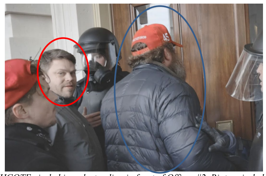
(HEATHCOTE circled in red, standing in front of Officer #2, Rioter circled in blue)