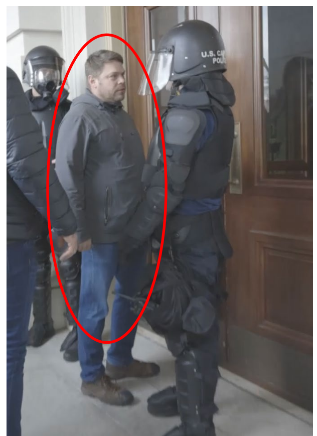
(HEATHCOTE circled in red engaging with Officer #1)