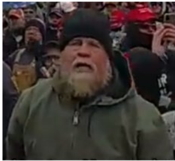
Photograph #333 - AFO B