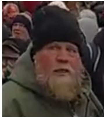
Photograph #333 - AFO A

Photographs of “333-AFO” Obtained from MPD BWC Footage and Included in FBI “Seeking Information” List Posted on fbi.gov