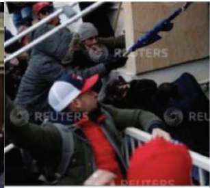
White male, first seen wearing olive jacket over red down vest over blue hoody. Large curved ears & 2 to 3 days of facial hair.