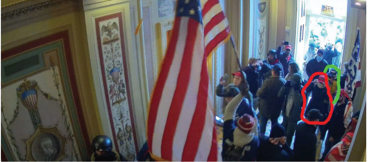
Image 1: Screenshot of CCTV footage showing DUONG and MILLER entering the U.S. Capitol through the Senate Fire Door.