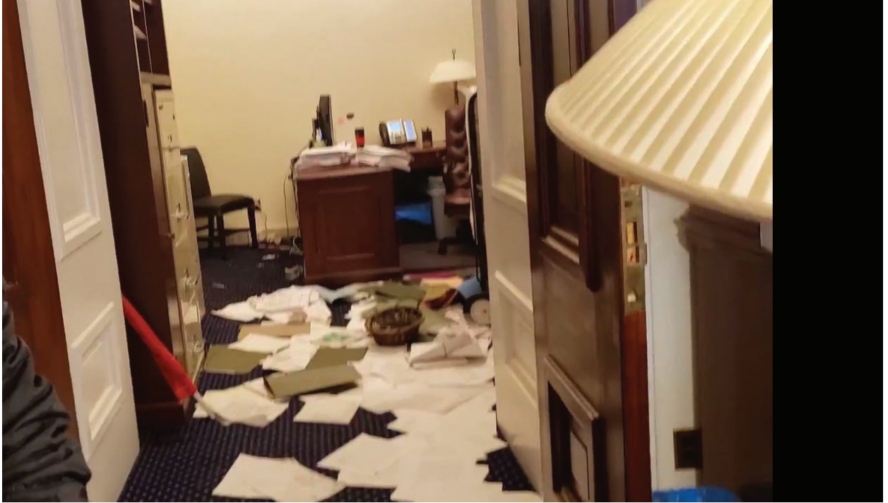
Image 3: Screenshot of MILLER'S video recording of the destruction that had taken place in the Senate Parliamentarian's office suite.