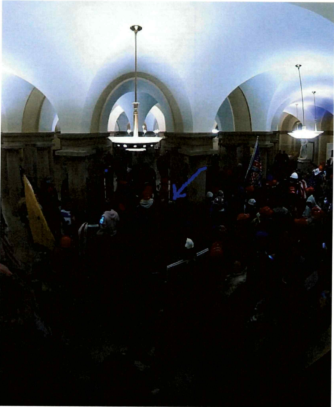
The staff operations specialist next observed CRUZ walk back towards the Senate Wing Doors on the northwest side of the building through which he entered the U.S. Capitol, and exit the building at approximately 2:21:02 p.m.: