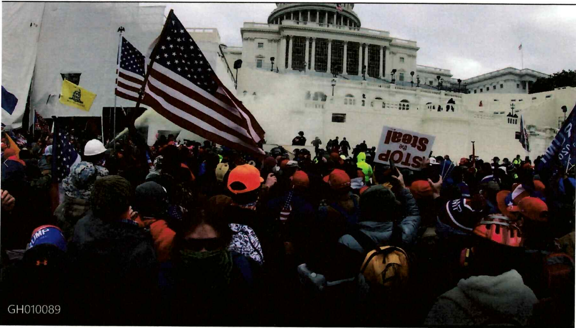
The following image is depicted later in the same GoPro video taken by CRUZ as he walked towards the U.S. Capitol building. A man is shown trying to break a window near the West Stair Doors: