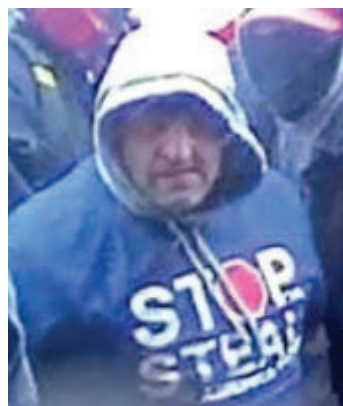
Photograph #483 – AFO B