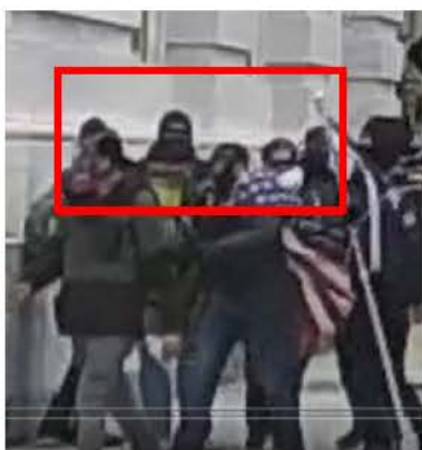
Figure 3: The CORDONs wearing masks after approaching gathering with police officers.