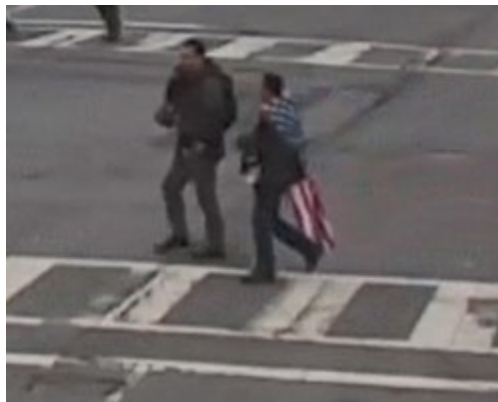
Figure 14: The CORDONS on First St, SE.

Public records indicate that K. CORDON uses telephone number (***) ***-8217. According to records obtained through a search warrant which was served on Verizon, on January 6, 2021, in and around the time of the incident, the cellular phone associated with (***) ***-8217 was identified as having utilized a cell site consistent with providing service to a geographic area that included the interior of the United States Capitol building. Billing records indicate that the phone number used by K. CORDON made calls from Washington, DC on January 6, 2021.