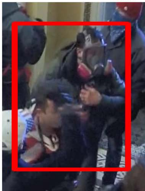
Figures 8: The CORDONs entering the Capitol building.

The CORDONs entry is consistent with statements K. CORDON made in his Ilta Sanomat interview that “they broke into the windows and uh there was people scuffling with the cops and