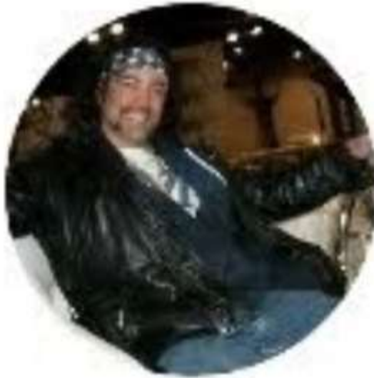
See Figure 2