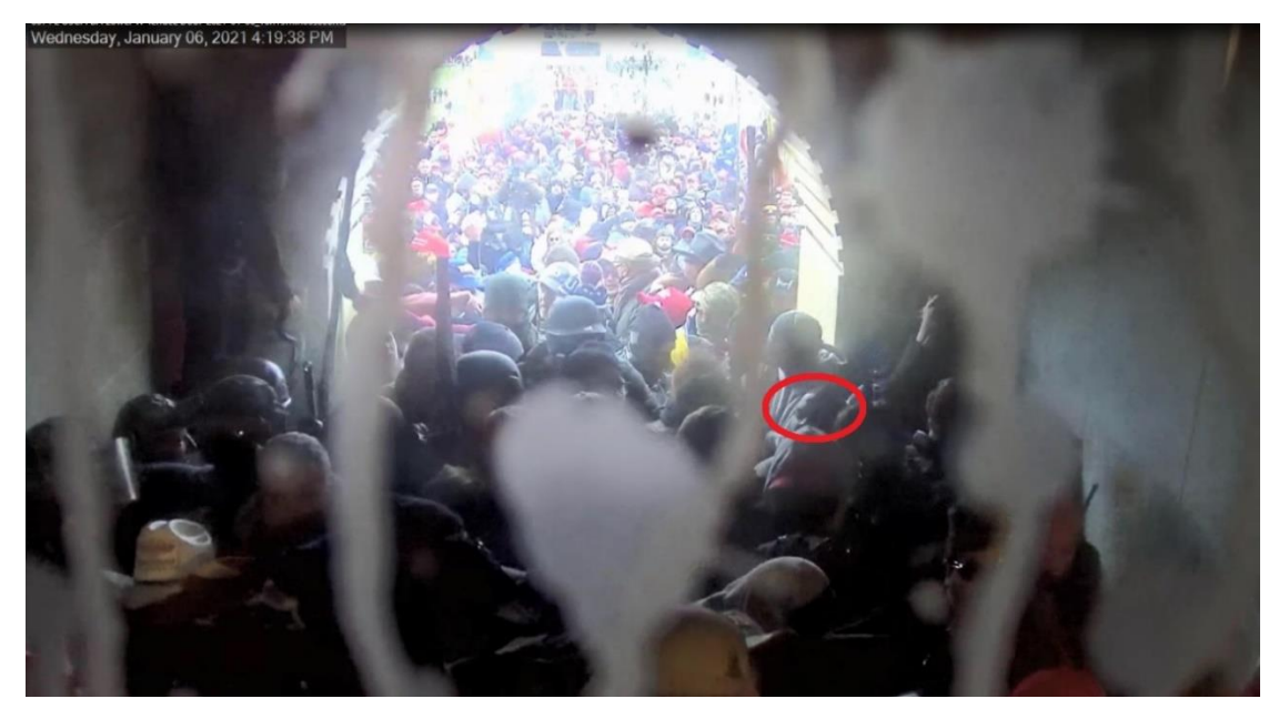
Figure 16: CCTV of ANDERSON, circled in red, advancing further into the tunnel.

to the U.S. Capitol building (Figure 16). Seconds later, ANDERSON advanced even further into the tunnel, pushing in unison with the mob against the police line (Figure 17).